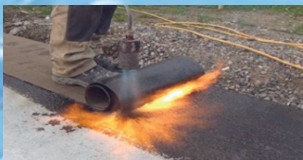
If sealing and insulation is defective...