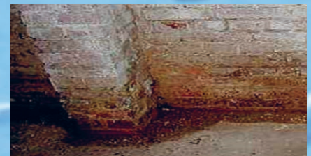
... damage becomes visible, regardless of plastered or rough masonry.