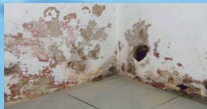
... damage quickly becomes visible in the form of greying and mould formation, etc...